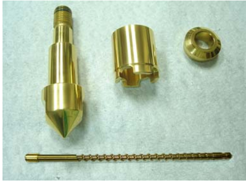
Wear-resistant and anti-corrosion screw rods by high power impulse plasma coating