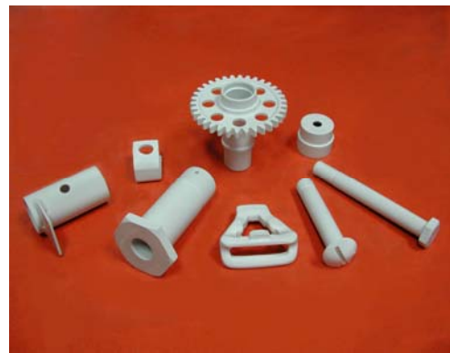
Contact corrosion-resistant aerospace components by plasma coating of thicker aluminum